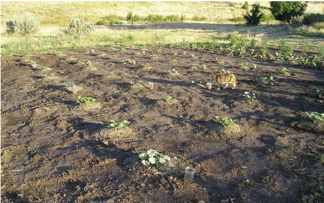
Figure 3: By July 27 most of the seeds had germinated and the seedlings were ready to thin. This is the view looking west from the east end of the plot. Glass mason jars scattered through the plot were used to monitor water distribution.

The hills were randomly assigned a variety and harvest frequency so that there were 5 hills of each variety and harvest frequency combination. An extra hill of each variety was planted in case some hills were damaged or aberrant. The hills were arranged in 5 rows of 8 – 9 hills. Each hill was planted with 5 seeds of the same variety and thinned to 3 plants while the plants were young. The hills were planted on July 11 and 12.