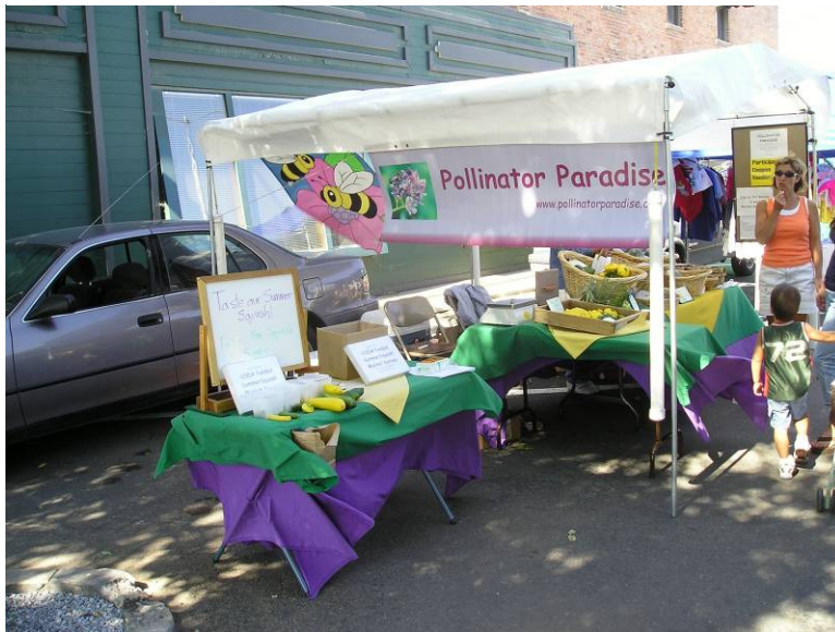
Figure 7: A survey table with samples of raw squash was set up next to our market booth on September 5.

Wednesday market survey and one Saturday market survey we hired a friend to grill squash so customers could taste the cooked squash before filling out the survey. The other Saturday market survey included tasting of raw squash.