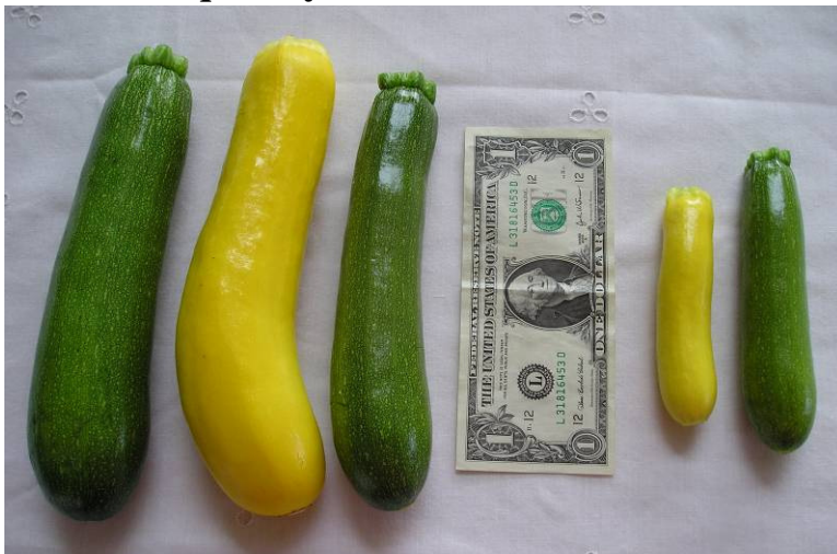
Figure 5: Typical size of zucchini harvested every 2-3 days on left, daily on right. Stems were cut to about 1/2 inch on large squash, a little less on small squash, before weighing. Photo taken 8/23.

Interestingly, the size at which I harvested the squash decreased late in the season as temperatures dropped and day length shortened. Table 1 shows the average weight of fruits harvested prior to September 16 and after that date for the 4 varieties and two harvest frequencies. When harvesting daily I picked patty pan varieties at a size that was 40% smaller during the second half of the season as compared with the first half. Green squash picked every 2-3 days decreased much less in size over the