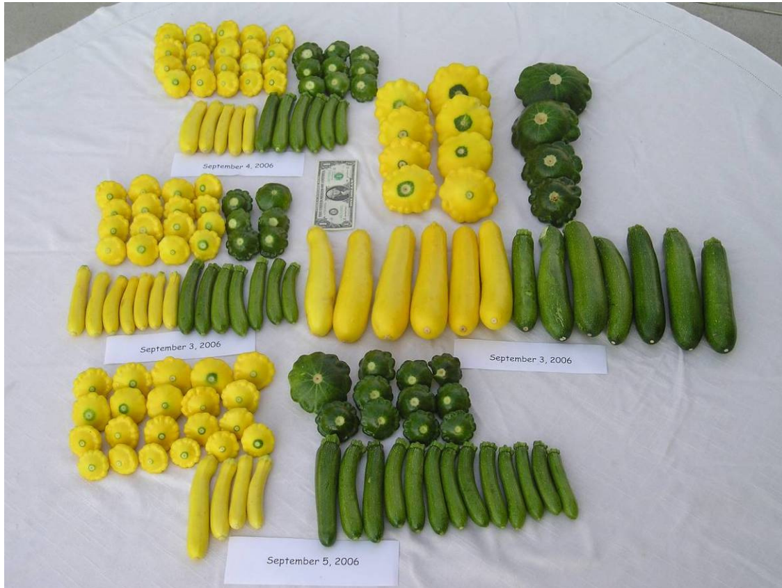
Figure 2: Squash harvest over a 3 day period. Large squash harvested 9/3, small squash harvested 9/3-5.