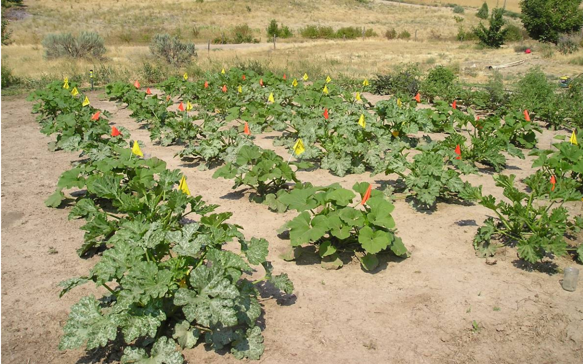
Figure 4: August 8, flowering begins. Flags indicate harvest frequency. Note that the leaves of zucchini varieties (e.g., bottom left and bottom right) were more deeply divided than were the leaves patty pan varieties (e.g., bottom center). This photo was taken from the same vantage point as Fig. 3.

Brown paper shopping bags were labeled with the hill number, variety, and harvest frequency of each hill, and were used to harvest the squash throughout the season. The squash were weighed individually after harvest each day.